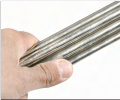
Thick Walled Stainless Steel Core