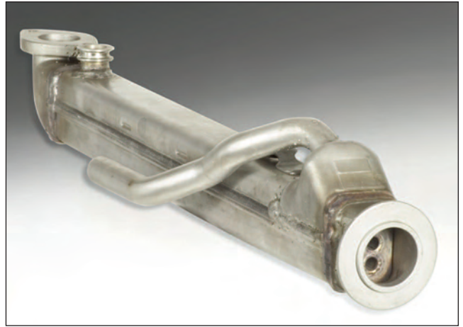
NT Shoptools' EGR Cooler, shown above