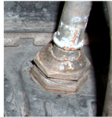
Quick Disconnect Fitting

If you have the threaded style fittings, the radiator is ready for installation.