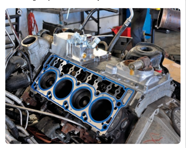
Ready for the rebuilt heads.

Head gasket failure is yet another common 6.0-liter Powerstroke problem. The fix is had with a new pair of gaskets and a set of ARP head studs.