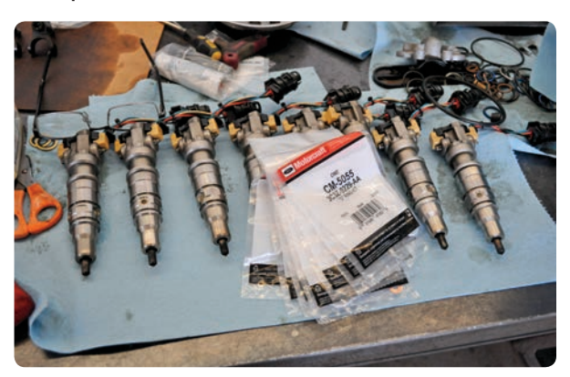
These injectors were in good shape, new gaskets and seals were installed, and they were re-installed in the heads.