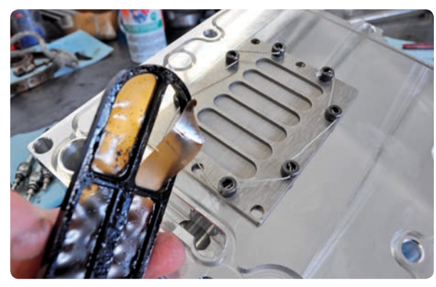
This screen is located below the oil cooler. It is there to stop contaminants from entering the injection system, potentially causing a no-start condition. They fail all the time like this one has. Bulletproof's new manifold uses a much more robust screen, which you can see in the background.