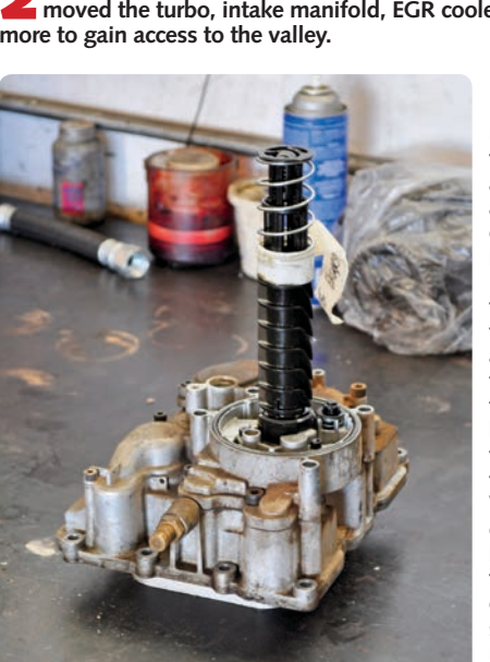
This manifold houses the factory oil cooler, a few sensors, and the factory oil filter. The black tube is what the factory drop-in filter surrounds and attaches to. Atop the tube is a bypass valve that is famous for breaking. When it does, oil completely bypasses the filter and sends contaminants straight to the high-pressure oil pump

(HPOP) and injectors. This is the last you'll see of this manifold. It will soon be replaced by a new Bulletproof Diesel part.