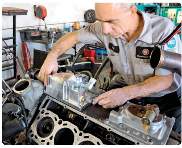
Here Del installs the new Bulletproof Diesel Transfer Block. The transfer block diverts engine oil down a hydraulic line to a new air-to-oil cooler and through a traditional spin-on filter, eliminating the problematic factory filter and cooler.