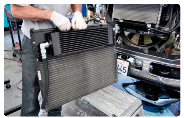
The new air-to-oil cooler mounts to the AC condenser with supplied bracket and hardware. Heavy-duty hydraulic lines connect the manifold in the engine's valley to the filter and new cooler. This air-to-oil cooler will keep the engine oil much cooler than the factory one. This means less deposit build up and better lubrication for the entire engine.