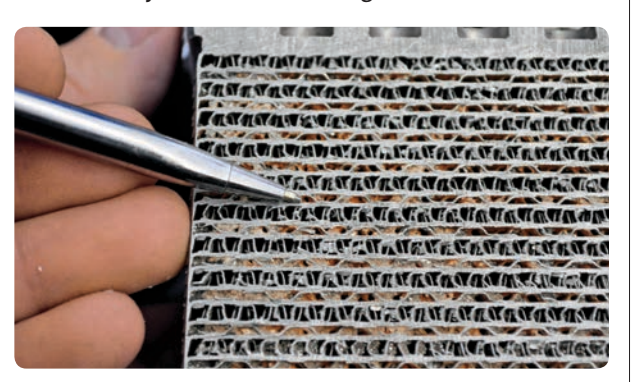
The factory oil cooler is a stacked plate heat-exchanger design. Coolant and oil flow through separate passageways stacked on top of each other. The problems with it are multifaceted. First, the coolant in this high-compression motor, like most, has contaminants from multiple sources, ranging from supplemental coolant additives and gasket material to leftover sand from the casting process. These contaminants clog up the passageways in the cooler and reduce its efficiency, thus creating hot, less-dense oil for everything down the line to use for lubrication. The turbo, injectors, and HPOP (high-pressure oil pump) all take a beating due to this, and failure eventually follows.

(HPOP) and injectors. This is the last you'll see of this manifold. It will soon be replaced by a new Bulletproof Diesel part.