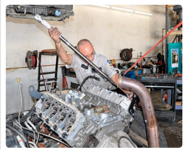
The final torque of the studs, done with ARP's Ultra-Torque on the threads, should be 210 ft.-lbs. Factory head bolts take a much less 85 ft.-lbs. of torque (plus another three-quarter turn of the wrench).