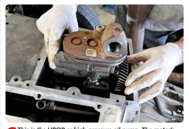
This is the HPOP or high-pressure oil pump. The motor's HEUI (hydraulically actuated electronically controlled unit injection) injectors use oil pressurized by this pump to inject fuel into the cylinders. Good, clean, and cool oil is extremely important to this power plant due to this HEUI system. Bulletproof removes and inspects the HPOP, if no problems are found, they replace all seals and reinstall it.