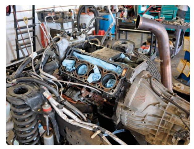
The valve seats in the heads tend to crack. So Del removed the heads and sent them out to be checked for straightness and to have the seats swapped out for hardened ones. Del then began to clean every nook and cranny of the disassembled engine until it was surgically clean.