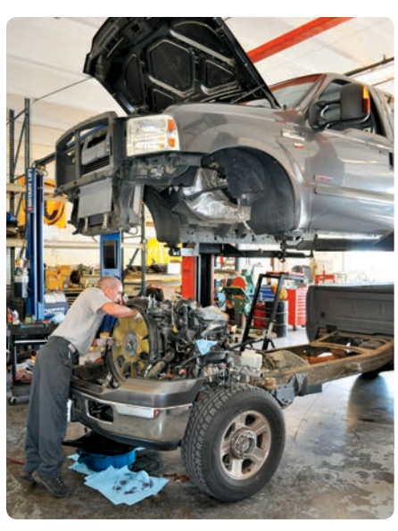
Accessing the motor for a repair like this one requires removing the cab. It's really not as bad as it looks, and only takes a couple hours to complete.