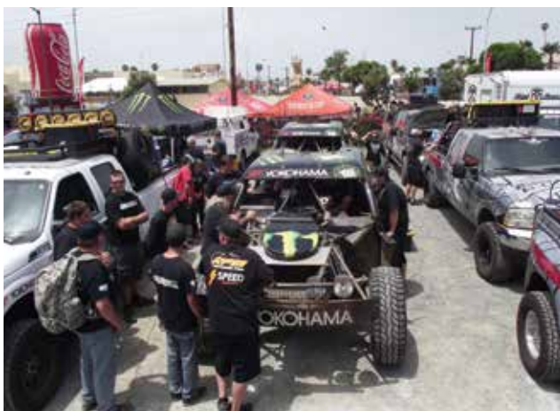
▲ South of the border, preparing for another desert race with the Desert Assassins crew.