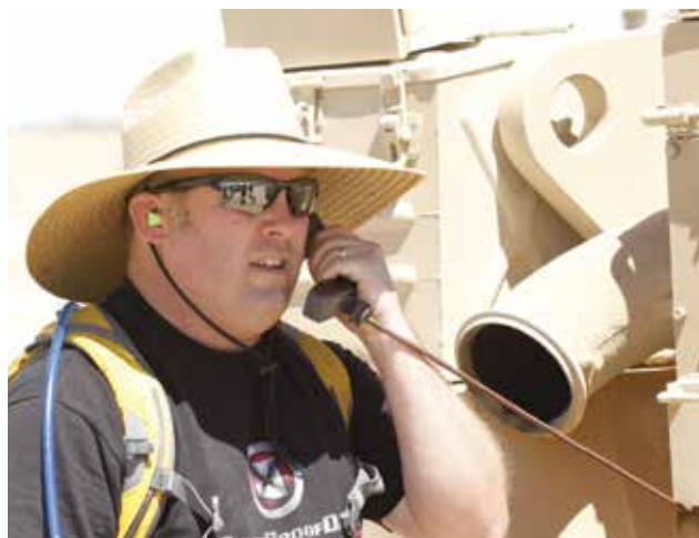
▲ "Uh, honey, yes, we're stuck out in the desert again."