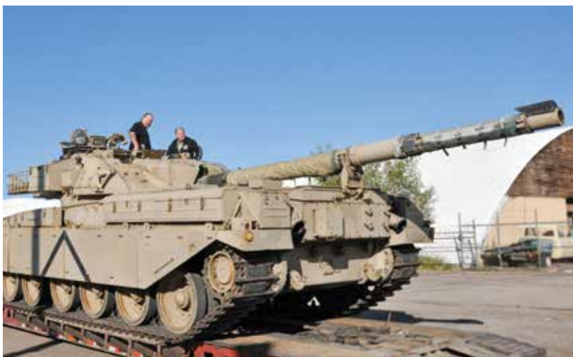
◀ One of the brothers' "off-road" vehicles: a '60s British Chieftain tank. And we just got word at time of print that they recently bought a troop carrier with tank tracks.

The Neal brothers fit into the off-road community deeper